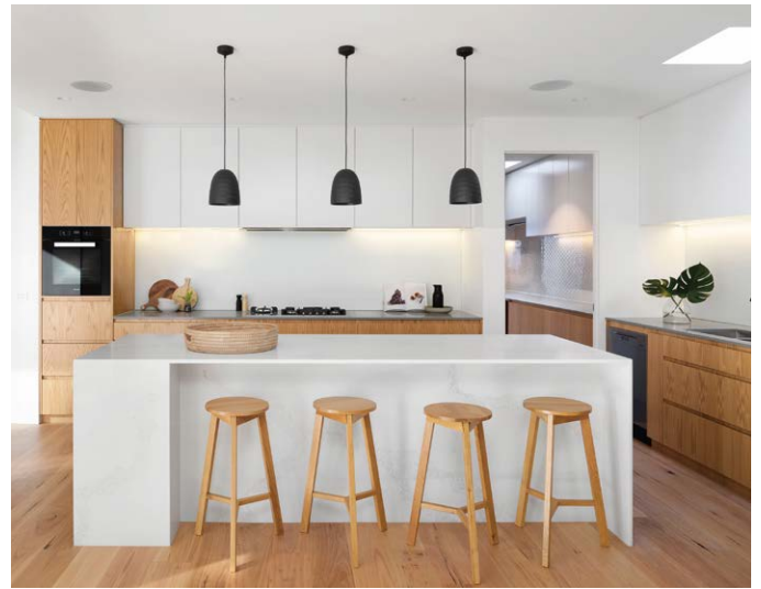
Acoustic insulation for interior flooring - under tile