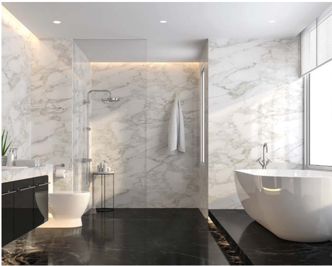
Acoustic insulation for bathrooms